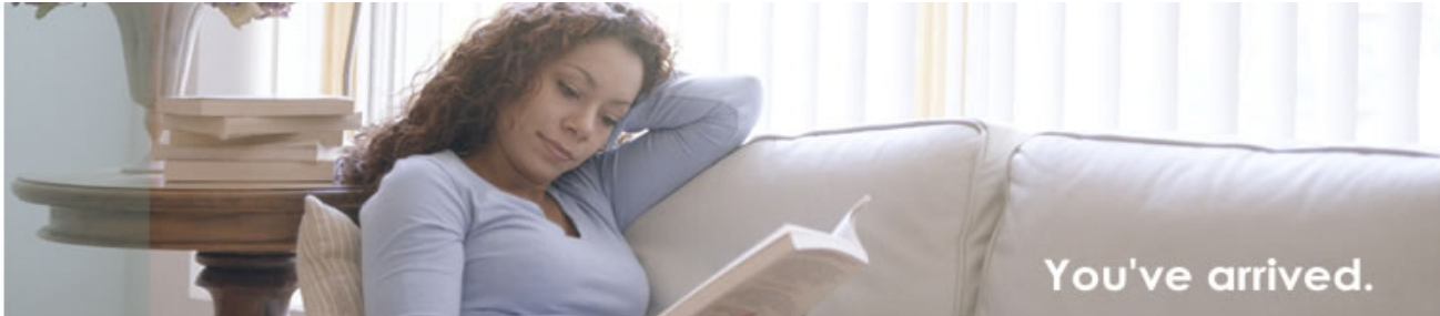
Park Close, Cutteslowe, Oxford OXDJPC

A recently refurbished two bedroom, one double and one single, ground floor property adjacent to Cutteslowe Park. Situated in a block of apartments which is just three storeys high, this is a perfect spot for those wishing to be near to Oxford city but also have easy access to the ring road. Off road parking is available. A quiet residential area tucked away in a beautiful part of Oxford.